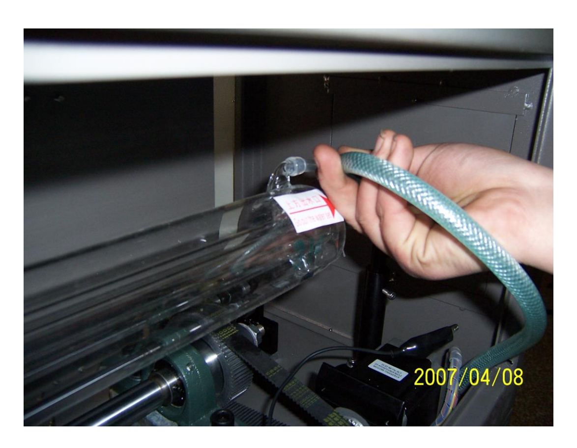
Automation Technology Inc.