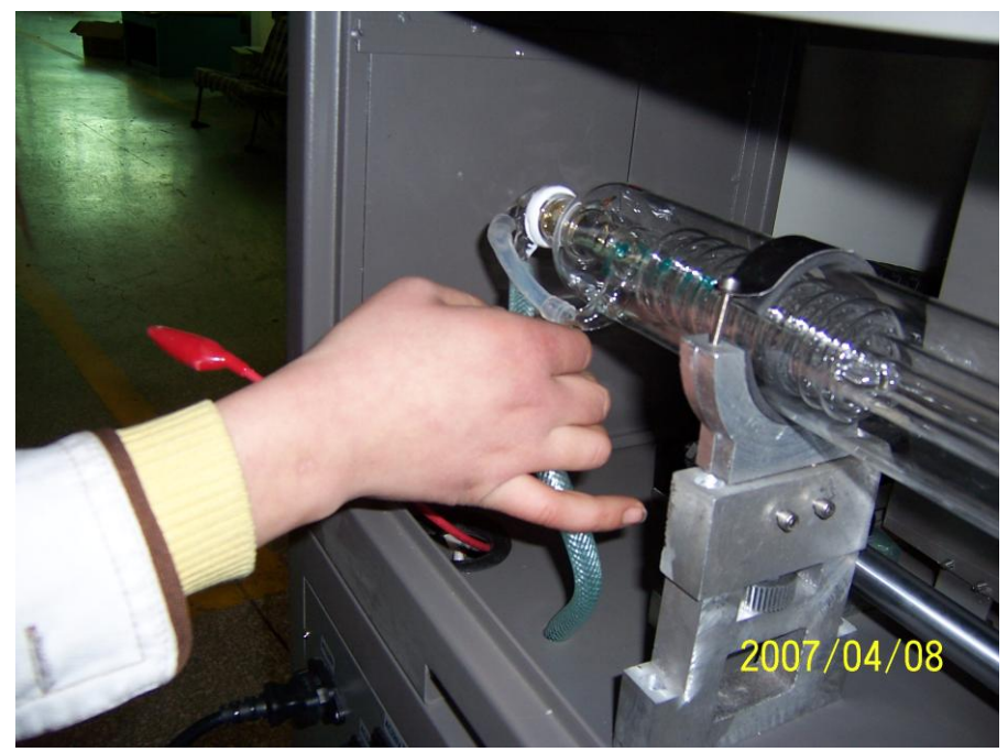
Plug in water inlet and outlet.