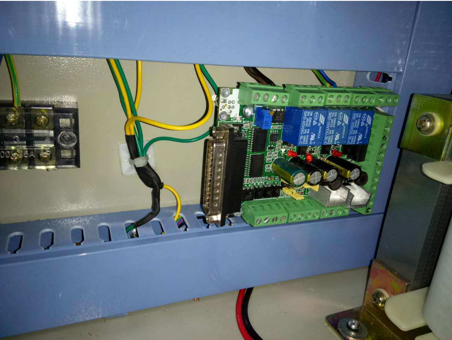
Left Side view of control cabinet